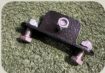
Low Mount Bracket

6. Open the (1) one Low Mount Bracket package and slide (4) four M8 Hex bolts into the Load Bar slot on both sides of the tent. Insert the bracket onto the bolts and loosely tighten them (by hand).