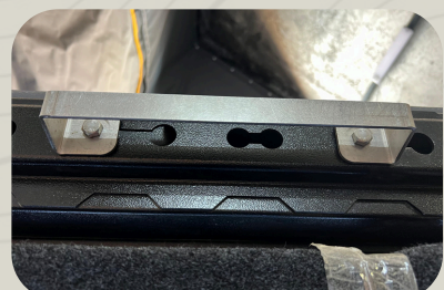
Ladder bracket fitted