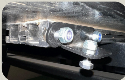
Hex Bolt in Load Bar slot

7. Measure the mounting surface with a measuring tape. Use the measurement to correctly space the low mount brackets on the tent.