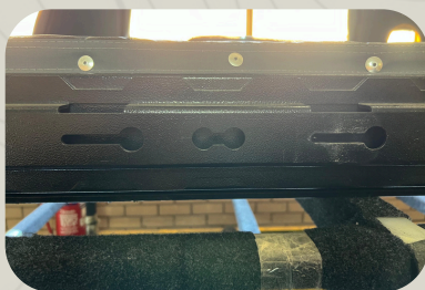
Accessory rail slots